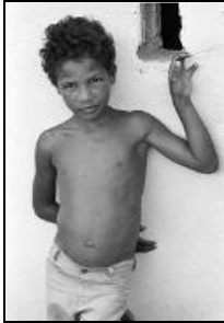
A Hidden Life for 30 Years