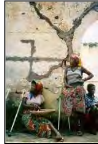
Two Ways of Desiring

We pause again to let the graces we have received penetrate our hearts more deeply. We are making this retreat "in the midst of our everyday lives." We let these reflections become "everyday" for us - more "familiar" and "comfort-able." We prepare to move into the contemplations that Jesus will show us, about his own life's journey.